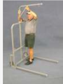
Insert Boom into slot on top of the M-Shaped piece. Make sure it bottoms out.