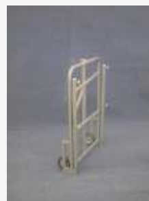
Trapeze shown in most compact configuration