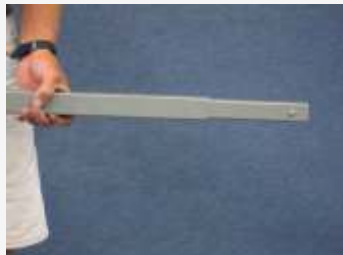
Align button on each leg and insert into top opening.