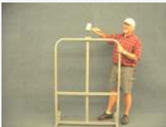
Use rubber mallet to tap down until it bottoms out.