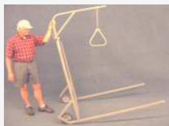
Trapeze is designed to tilt and roll. It is recommended to re- move the boom prior to moving.