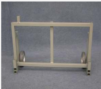
Set base in upright position.