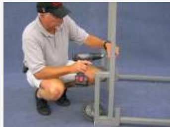
Using drill and socket cap screw provided, screw in the 4 self tapping screws.