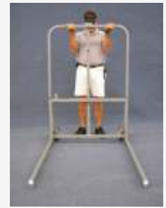
Insert M-Shaped part into the 3 slots. Adjust all levelers so they touch floor.