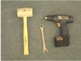
Tools needed: Rubber Mallet 3/4" Wrench & Drill