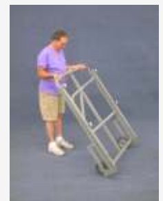
Easiest configuration for transporting from room to room.