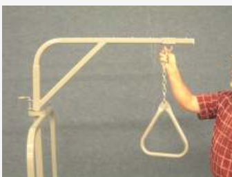
Unscrew the Quick-Link and hook over the Boom slider, then screw Quick-link closed