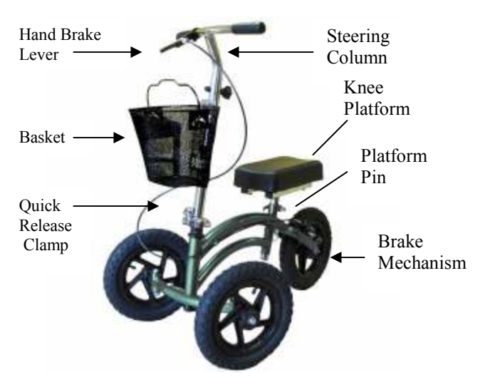
Weight Capacity = 400 lbs

Utilize this device for maximum mobility during your recovery from foot/ankle surgery or injury.